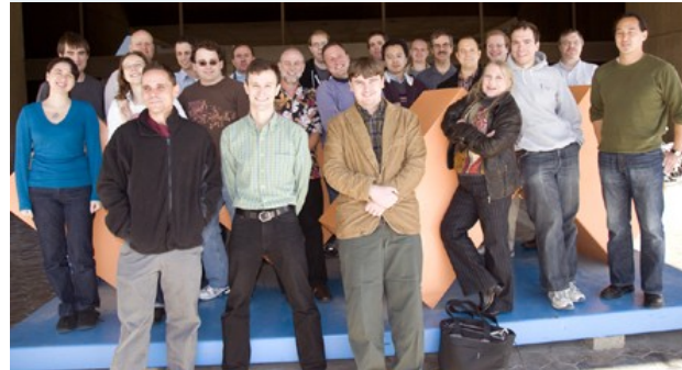
2009 CASOS Faculty, Staff, and Students