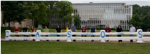
CASOS 2009 Summer Institute Photo

Participants learn about current trends, practices, and tools available for social networks analysis, link analysis, network simulation, and multi-agent network modeling and much, much more.