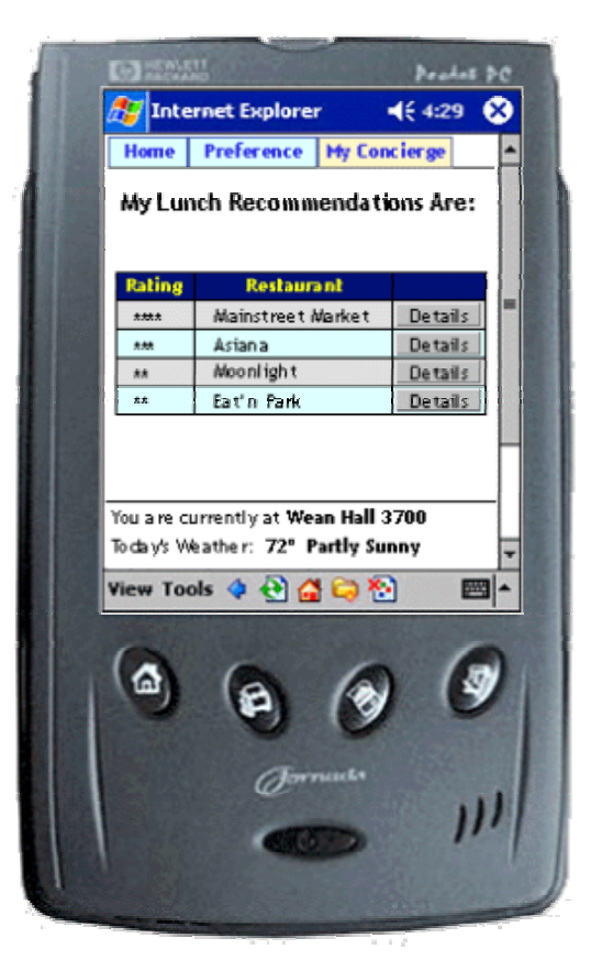
Fig. 2 This Restaurant Concierge is an example of a MyCampus Agent. It returns recommendations on where to have lunch, based on the user's current context and preferences (i.e. restaurant ratings are context and preference specific).

context-sensitive preferences (e.g. "when in class, I don't want to be disrupted by promotional messages) to decide which messages to show to the user.