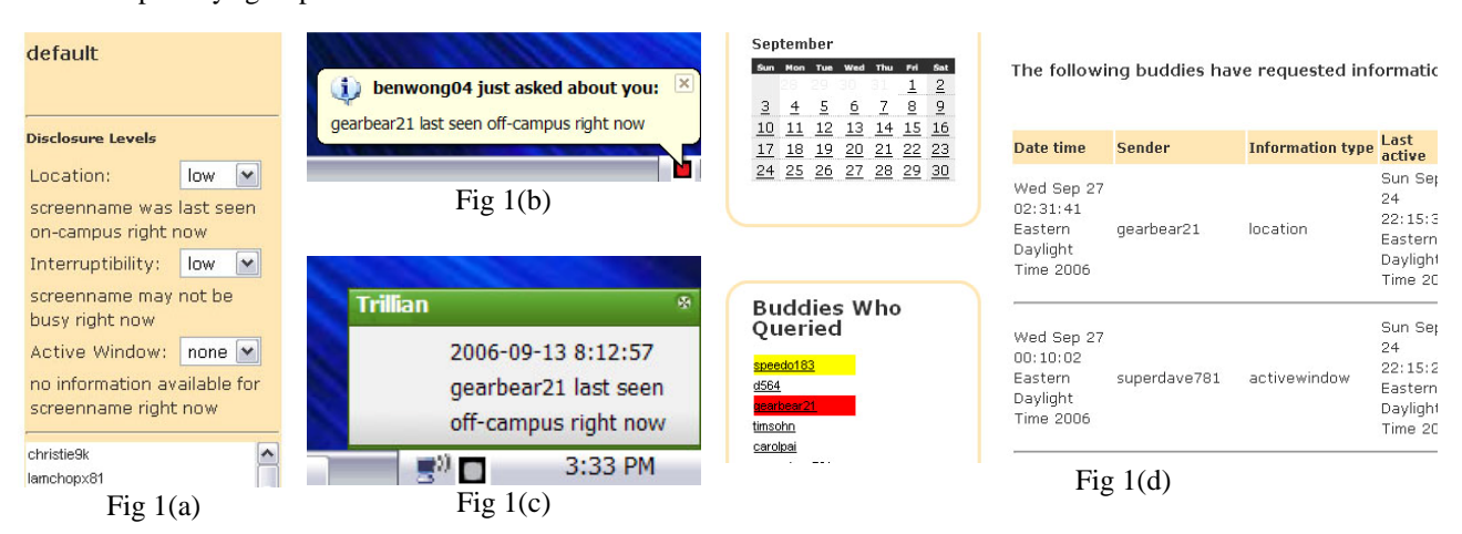
Figure 1. These screenshots show the control and feedback mechanisms of imbuddy411. The configuration user interface (a) shows what information will be disclosed by default. A notification (b) lets users known when someone is requesting information. A grounding and social translucency mechanism (c) lets a user know what the other person knows, and is shown at the start of a conversation. A disclosure history (d) lets people audit disclosures.

More importantly, although all our participants agreed that the three information types being disclosed were all potentially sensitive (interruptibility: 3.6, location: 4.1, active window: 4.9, all out of 5), our